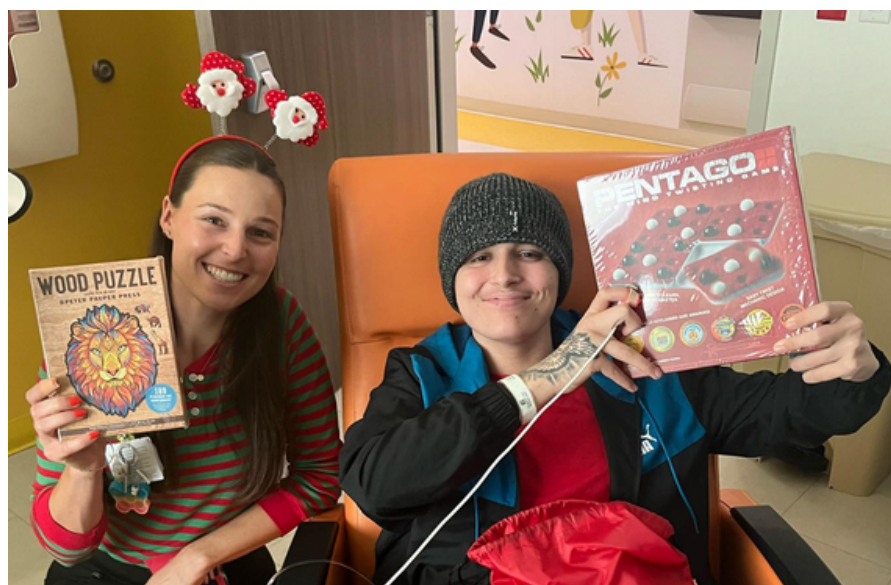
Christmas in July!