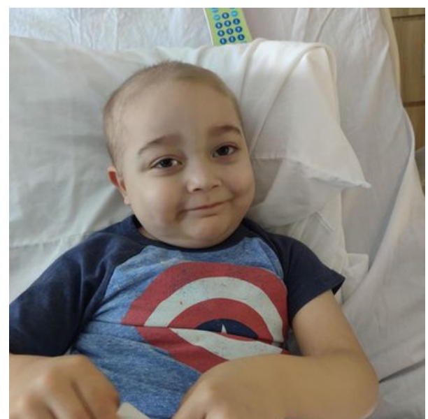
Kaysen, 6, fighting ALL in Montana.